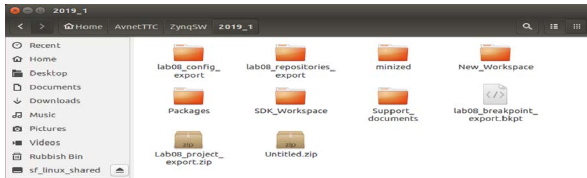
Figure 1 – Zynq Software Course Files Extracted

Appropriate paths are included within the archive which will create a sub-folder structure containing lab instructions, slides, solution files, and support documents under the Home/training/AvnetTTC/ZynqSW/2019_1/ folder: