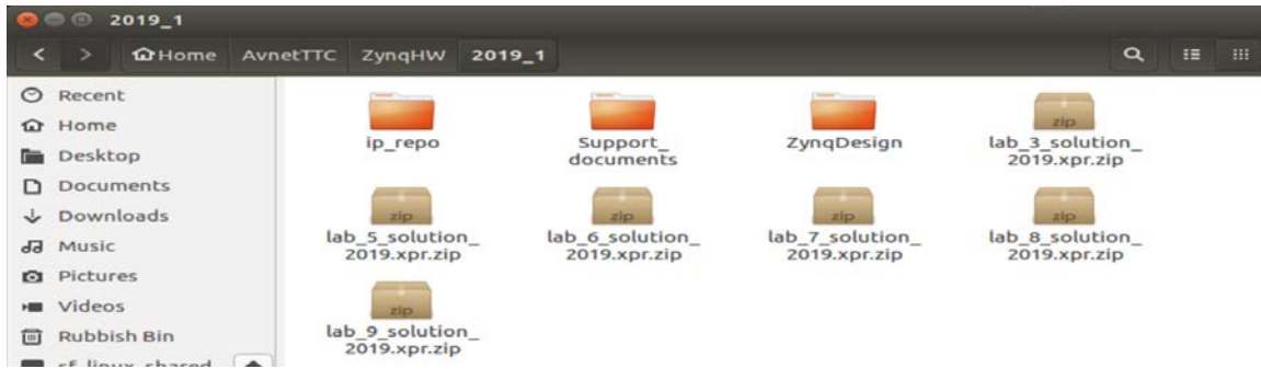
Figure 2 – Zynq Hardware Course Files Extracted

Appropriate paths are included within the archive which will create a sub-folder structure containing lab instructions, slides, solution files, and support documents under the home/training/AvnetTTC/ZynqHW/2019_1/ folder: